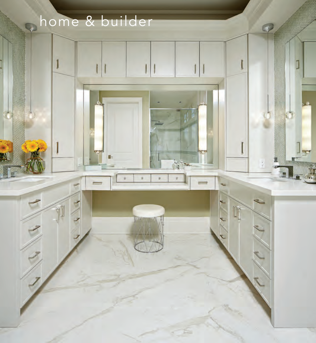
LEFT: The master en suite is a mix of elegance and functionality with plenty of mirrors and storage to help with primping and keeping things tidy. BELOW: Lots of glass elements add a spacious and airy feeling to the master en suite. BOTTOM: A large rain showerhead creates a relaxing experience in the shower while the handheld makes washing up even easier.