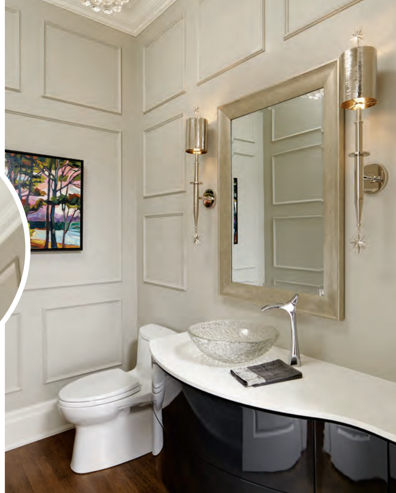
RIGHT: Even in the powder room, no detail was overlooked, including providing enough wall space to feature some of the owner's collection of original artwork. BOTTOM RIGHT: Original artwork features many outdoor and natural scenes painted by Canadian artists.

The kitchen, with its cabinetry by Crescent Cabinet Co. Ltd. and granite counters from Granite By Design Ltd. , is timeless and pared down. It was designed with function in mind and as the backdrop for everyday life as well as special gatherings. "The kitchen's always the spot where people end up," the homeowner notes. "I love that even if we're in here, we're still connected to whoever is in the family room. We had everyone here this past Christmas and for the first time I can remember, all the kids were in one place with the entire family. It was fantastic."