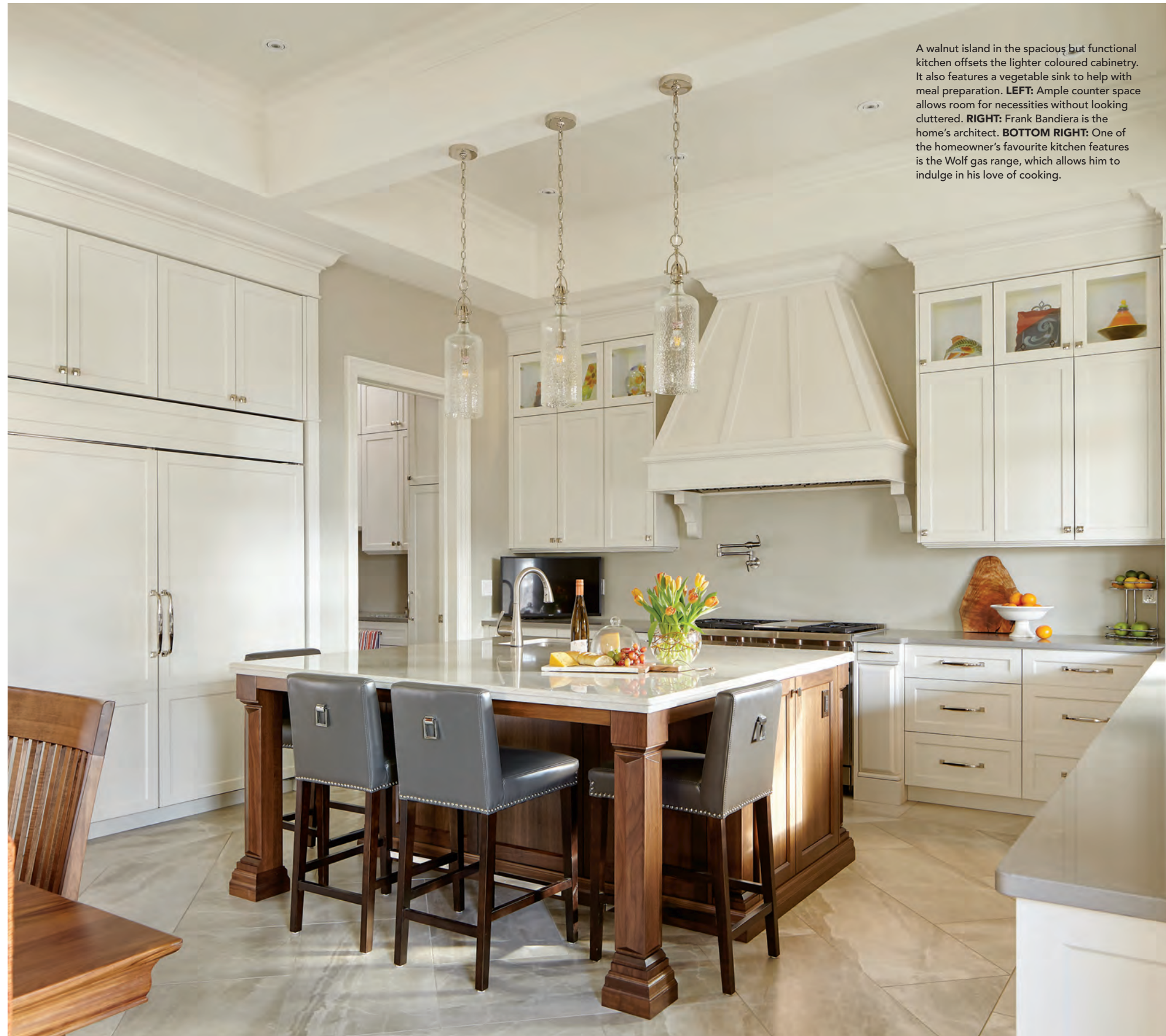
A walnut island in the spacious but functional kitchen offsets the lighter coloured cabinetry. It also features a vegetable sink to help with meal preparation. LEFT: Ample counter space allows room for necessities without looking cluttered. RIGHT: Frank Bandiera is the home's architect. BOTTOM RIGHT: One of the homeowner's favourite kitchen features is the Wolf gas range, which allows him to indulge in his love of cooking.